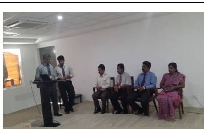
EDP on Medical Textiles –Emerging Opportunities at SITRA on 04.03.2015