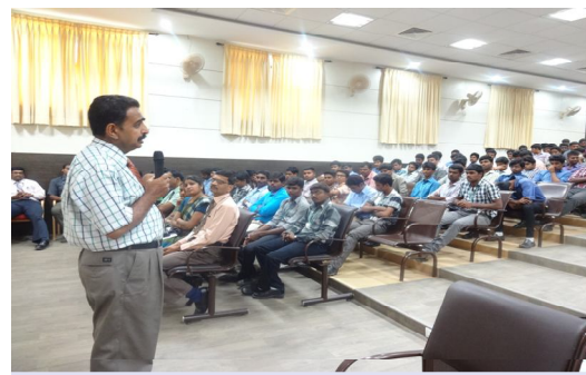
Counselling for Higher Education & Special Session on Marketing Excellence Through Creativity for UG Students on 11.02.2015