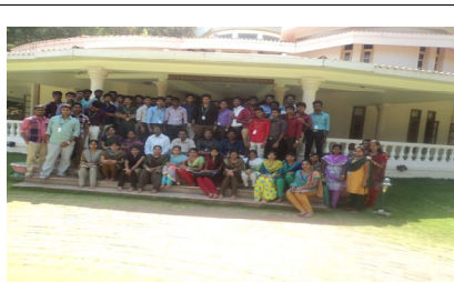
Event Management Programme (Harmony 2015) on 19.02.2015