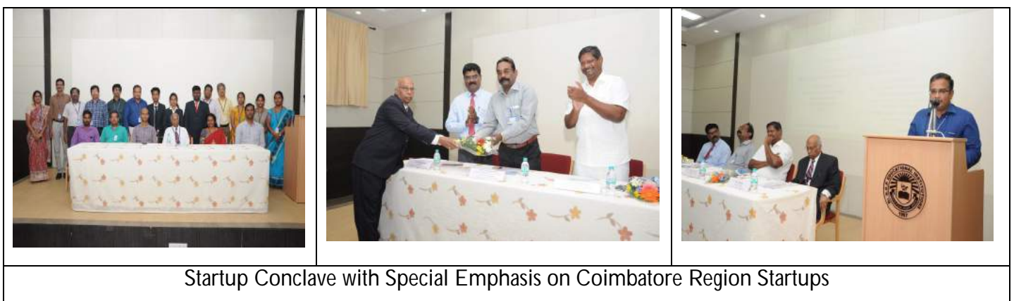
Startup Conclave with Special Emphasis on Coimbatore Region Startups