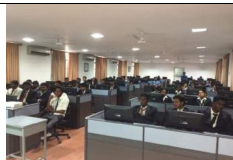
CII Webinar on Business Protection for MSMEs