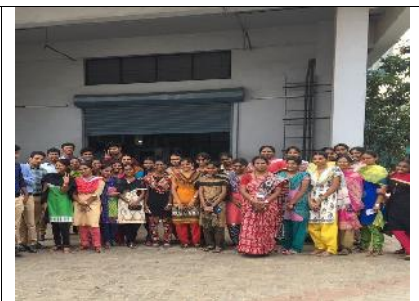
Industrial Visit to THE HINDU