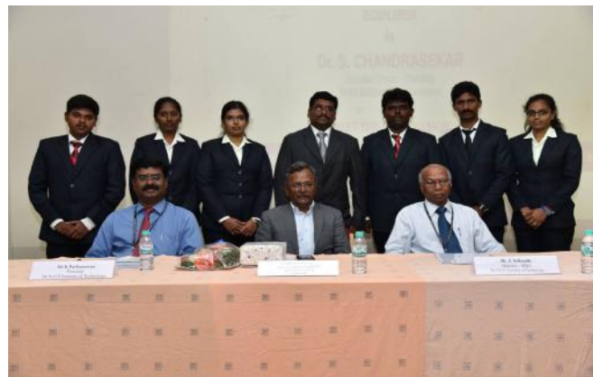
Meet the CEO