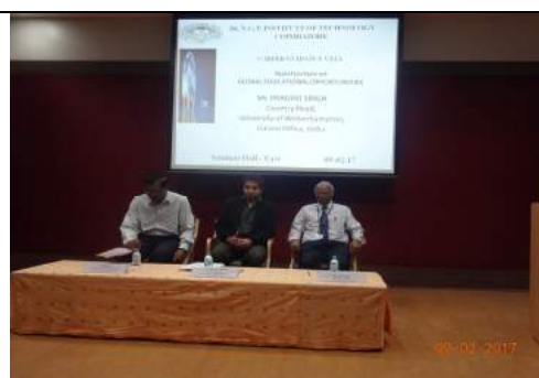
Guest Lecture on Global Educational Opportunities