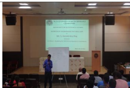
Workshop on Bridging the Skill Gap