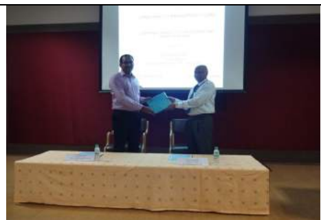
Seminar on Basics of Investment and Smart Investing