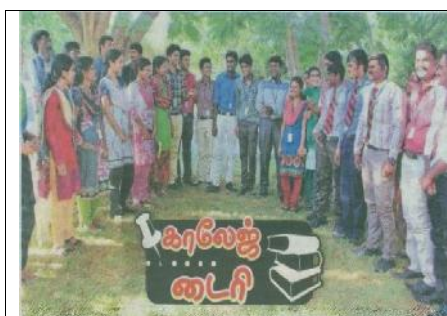
Talk Show on Cauvery Water Dispute