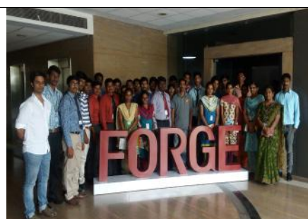
Industrial Visit to Coimbatore Innovation and Business Incubator