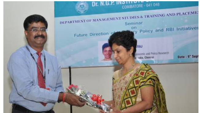
Seminar on Future Direction of Monetary Policy and RBI Initiatives