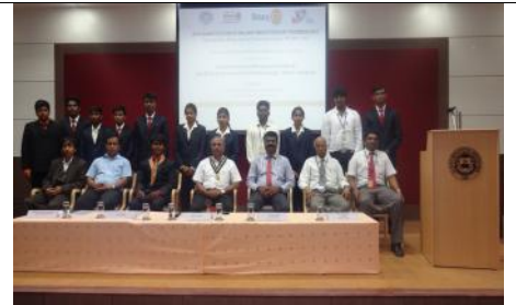
Installation of Dr. N.G.P. IT Rotaract Club