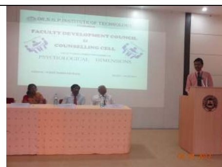
FDP on Psychological Dimensions