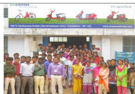
Industrial Visit to Ampere Vehicles Pvt. Ltd.