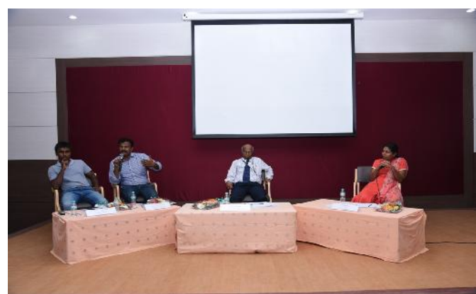
Career Day Programme - Panel Discussion