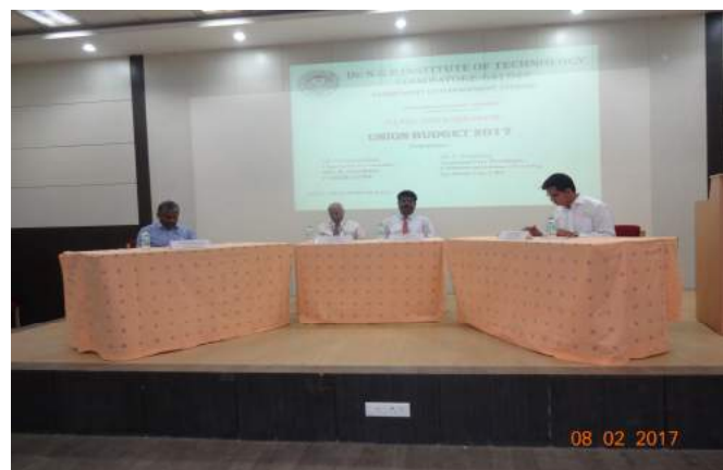
Panel Discussion on Union Budget 2017