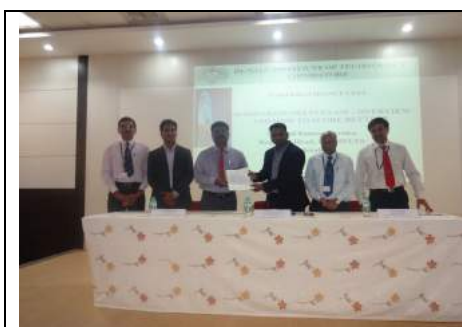
Seminar on IELTS Exam - Overview & How To Score Better