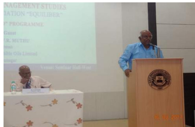
Meet the CEO