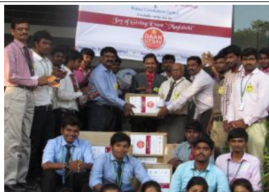
Joy of Giving - 'Magizhchi'