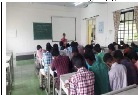
Extension Activity – TANCET Coaching