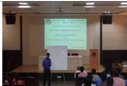
Workshop on Bridging the Skill Gap