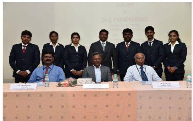
Meet the CEO