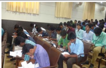
GATE and Competitive Exams – Challenges and Opportunities