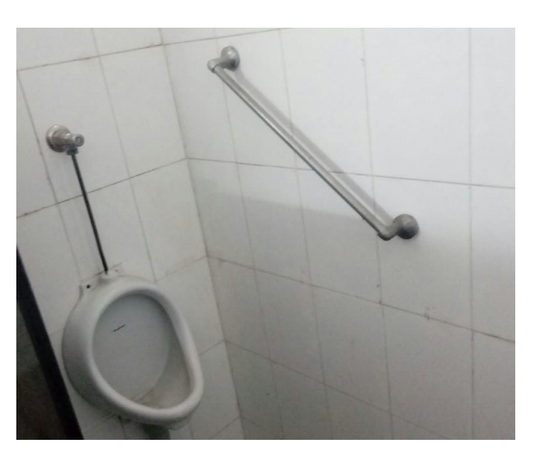
Rest Room for Physically Challenged