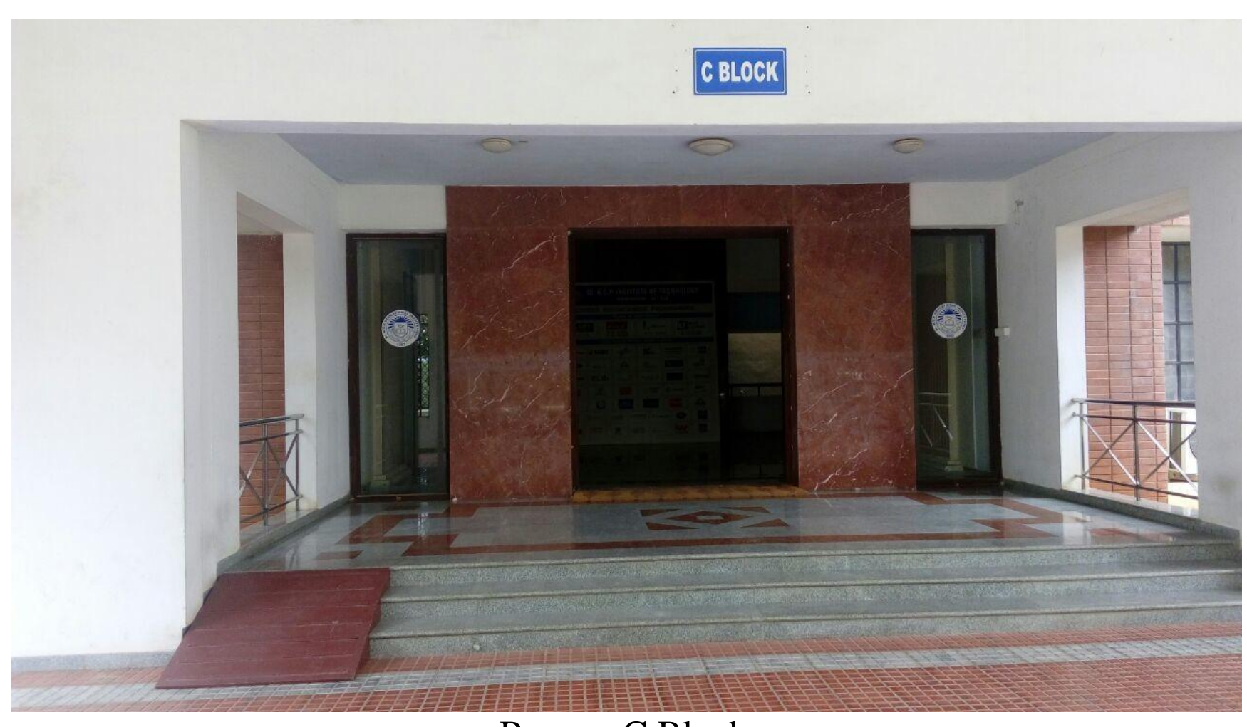
Ramp - C Block