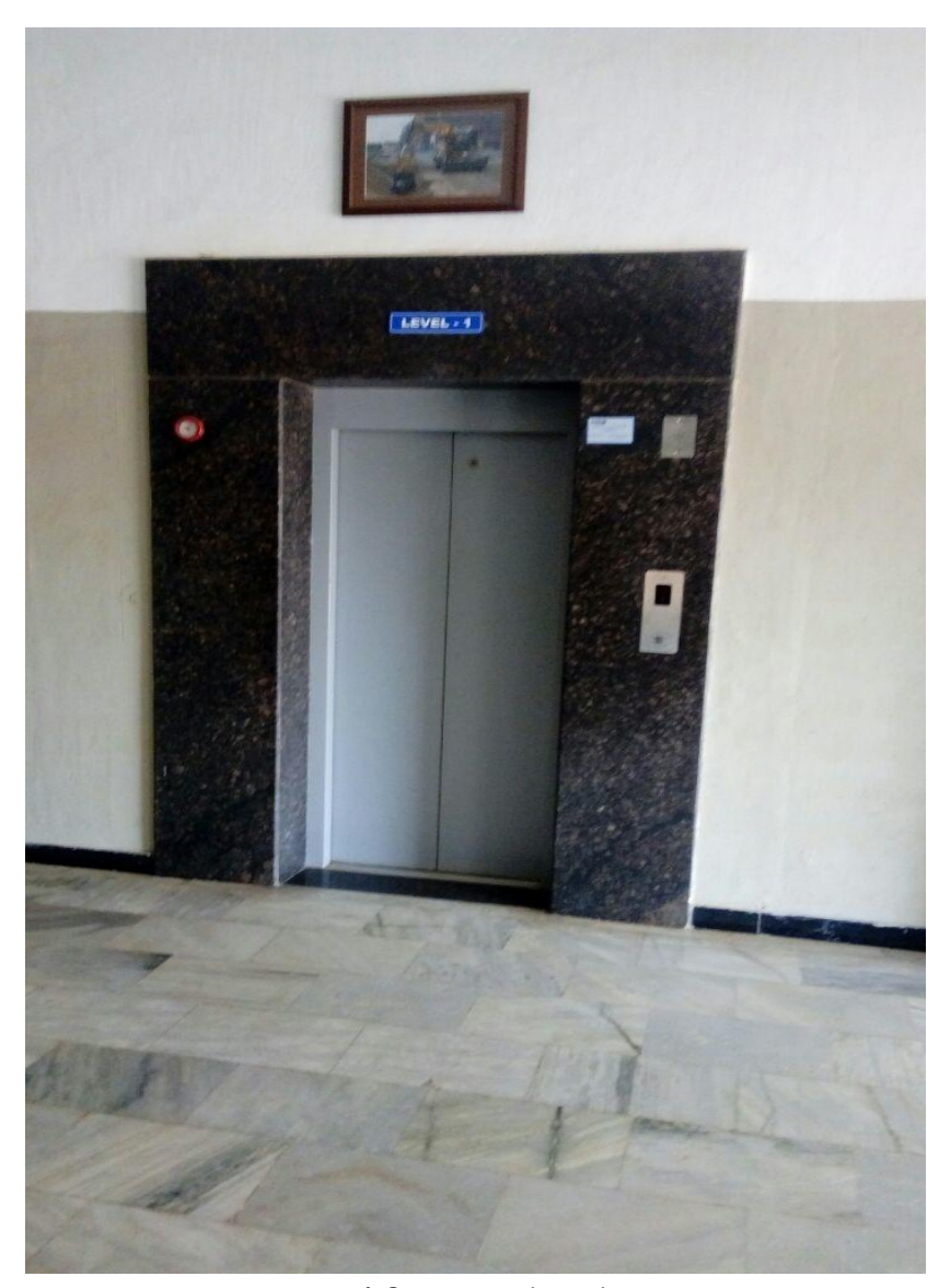
Lift D Block