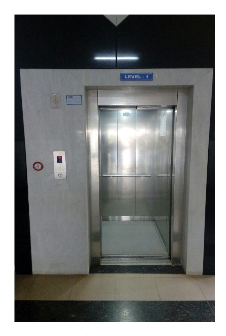
Lift B Block