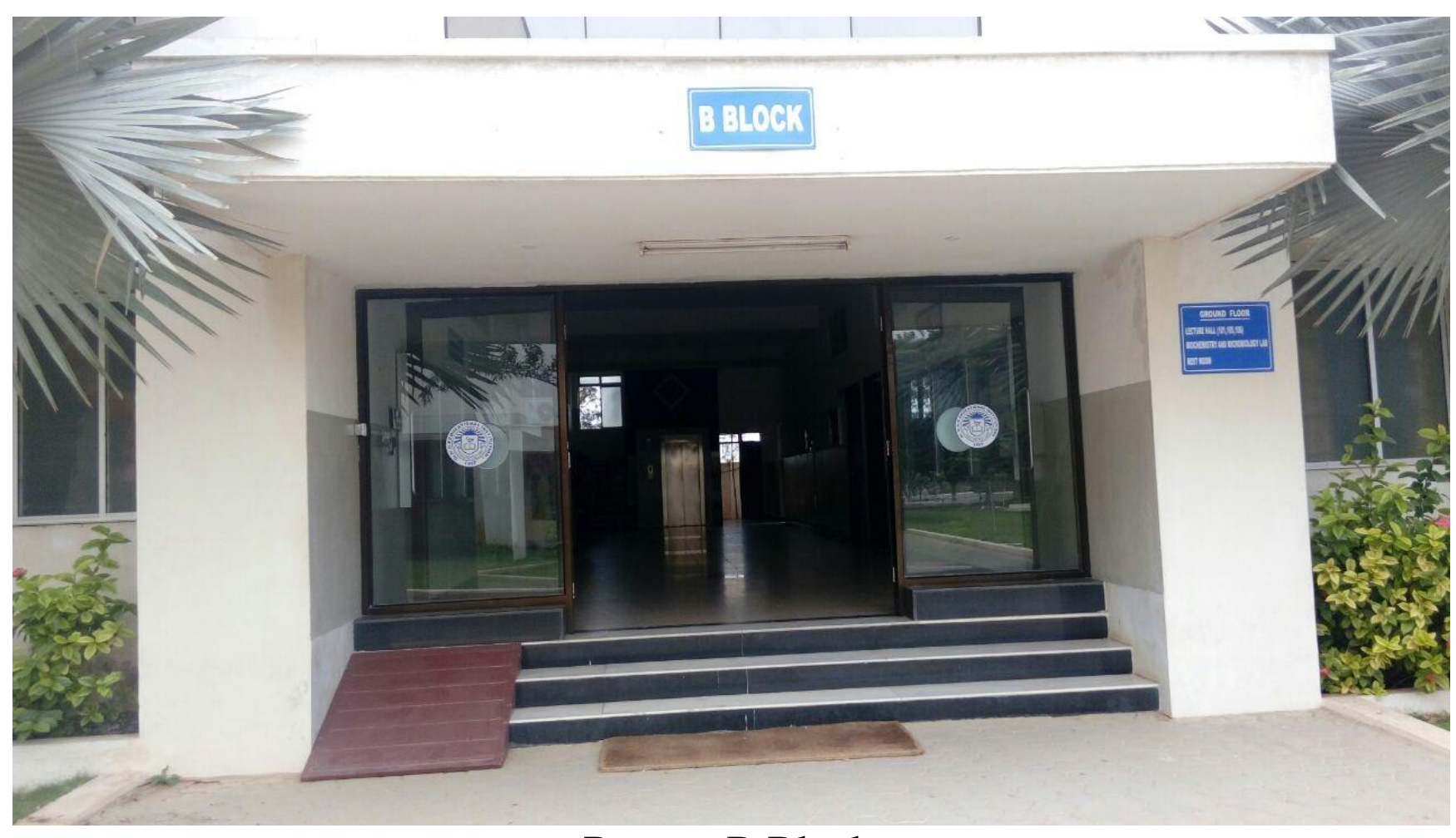
Ramp - B Block