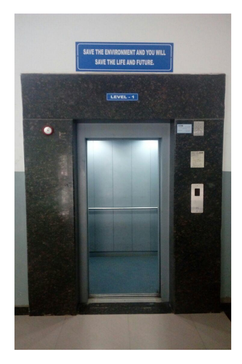
Lift - A Block